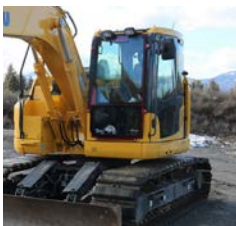
Bolts directly over OEM window.