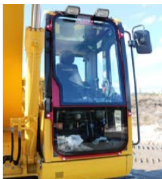
UL752 Level 1 Ballistic Door.

Heavy Equipment Armor's guarding products add another layer of safety for the operator and the machine. A company's most valuable asset is protected – It's people . This reduces injuries which reduces costs and improves work quality at the same time.