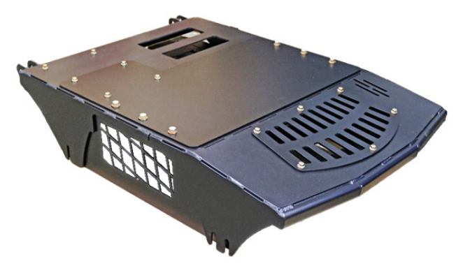
Top Cab Guard for Skid Steer Cab PART# CATD-CG

PLEASE NOTE: This quard is intended as a brush quard only. It is not a certified FOPS/ROPS quard.